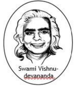
Swami Vishnu- devananda